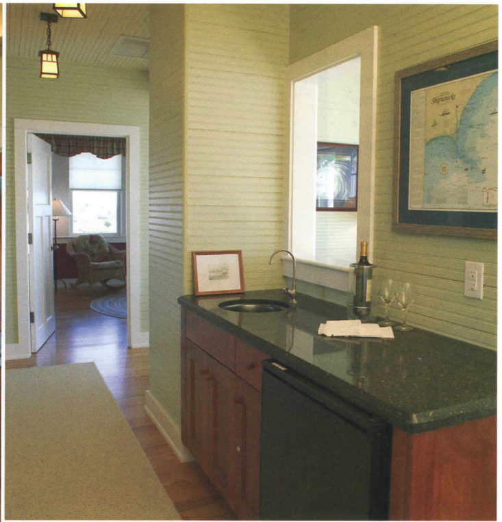
Opposite page: Cape Watch Cottage (as viewed from the beach) is a sprawling home that manages to remain intimate and charming. This page, left: The foyer, with its inlaid compass rose in the hardwood floors and exceptional interior details, makes a captivating first impression. Above: The wet bar at the top of the stairs services the game room and oceanfront porch beyond, as well as the three upstairs bedrooms.