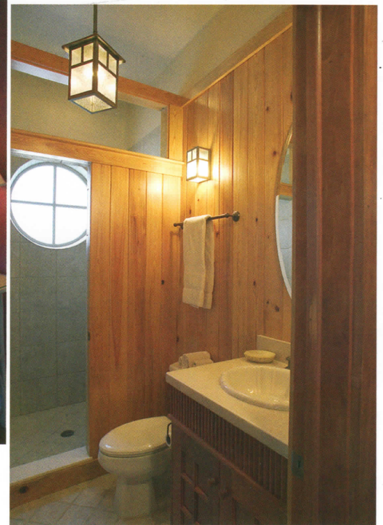
Left: This upstairs bedroom connects to the screened porch overlooking the ocean. Above: What appears to be a powder room has a surprise hidden behind its cypress paneling—a full-size shower.

Other exterior architectural details include cedar siding with white trim, exposed beams and whimsical dormers that Chuck playfully describes as "witches' hats." To a passerby, the house appears large, but very livable—a seaside cottage that is both sprawling and intimate. In keeping with Bald Head Island's philosophy of environmentally sensitive development, the house was situated on the lot to preserve as much of the native vegetation as possible, creating a privacy screen as well as a wooded setting.