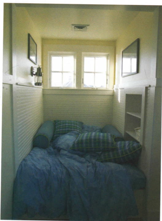
The bedroom on the northwest corner does not have ocean views, but it does have an alcove—a sort of extra large window seat, fondly referred to as the game nook.

"It's all about relationships here—the new ones we've made and the lifelong ones we continue to cherish," said Holly.